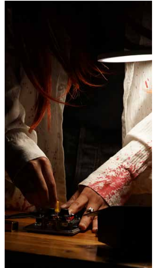
Tårnby Park Performance Festival Økocity 2.0, Copenhagen, 2024