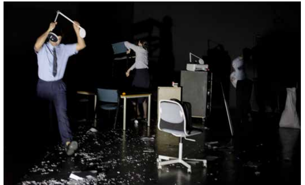
PLEASE HOLD HAUT Scene YC Festival, Copenhagen, 2023