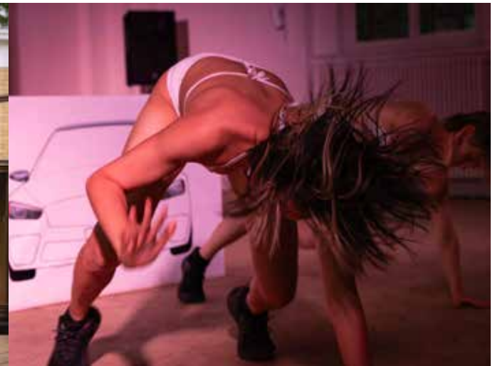
SEEMS TO BE Kiezkapelle, Berlin, 2023