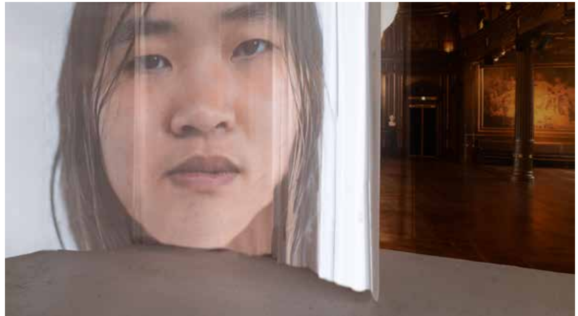
Galleri Image, Aarhus, 2024