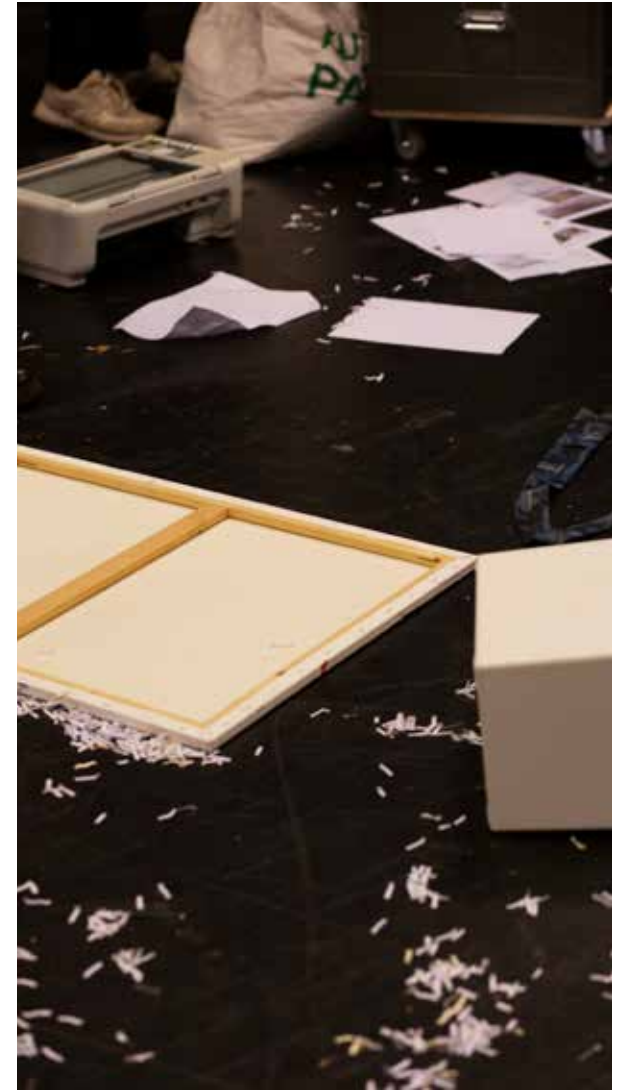
HAUT Scene YC Festival, Copenhagen, 2023