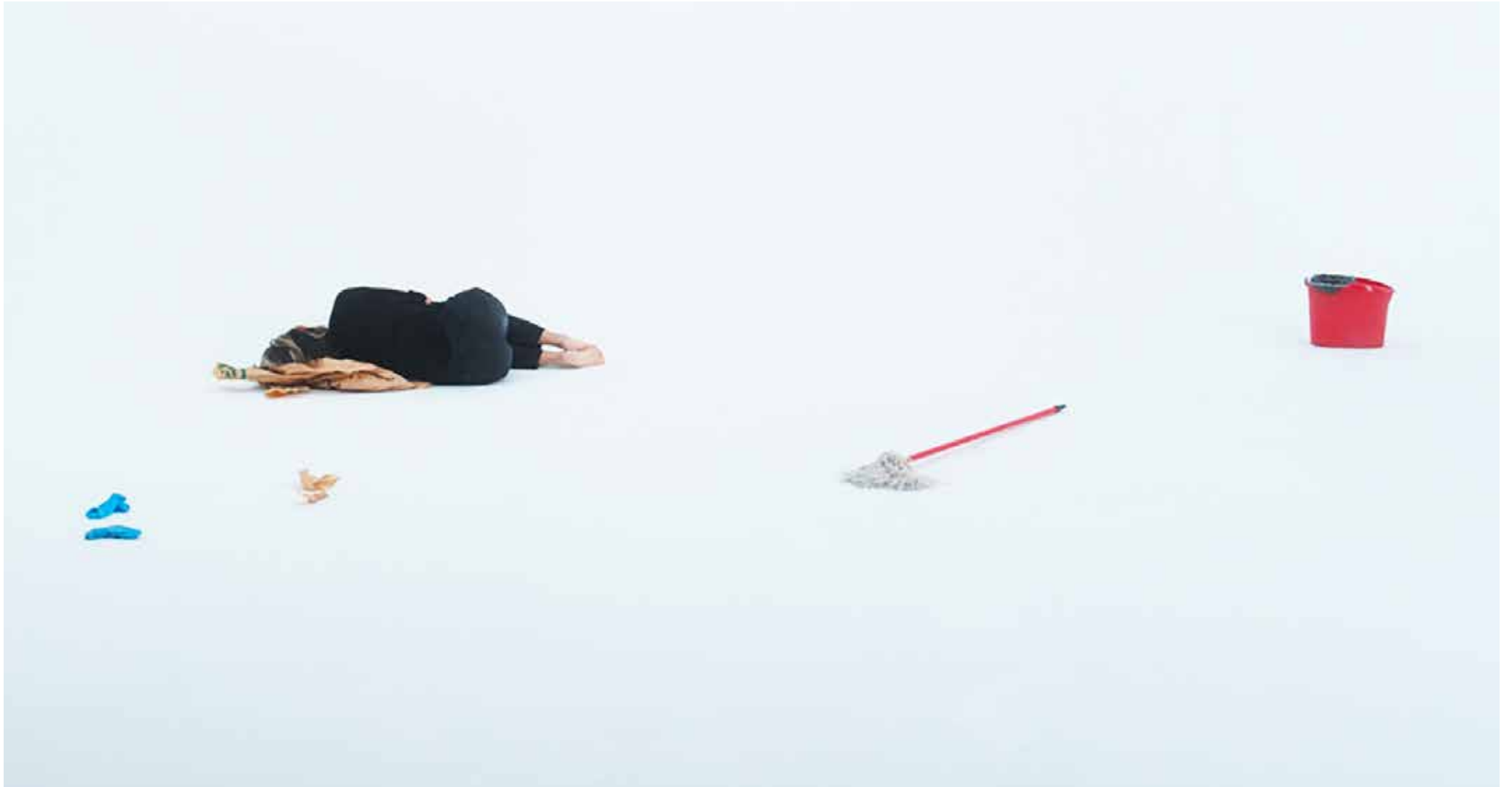
GESTURES OF CARE BECOMING A WARRIOR Film still by Gotfat