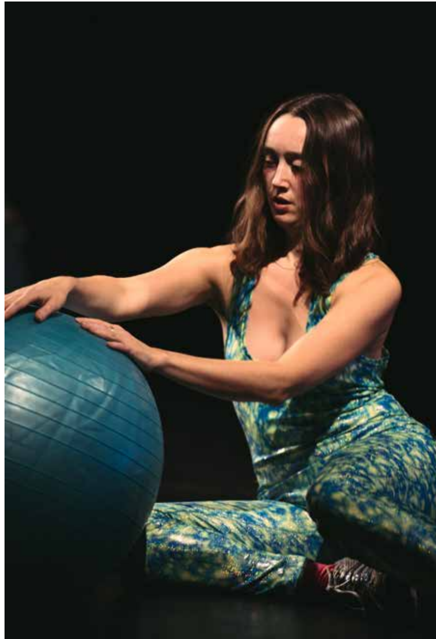
SKIMMED WORDS HAUT Scene, Copenhagen, 2022