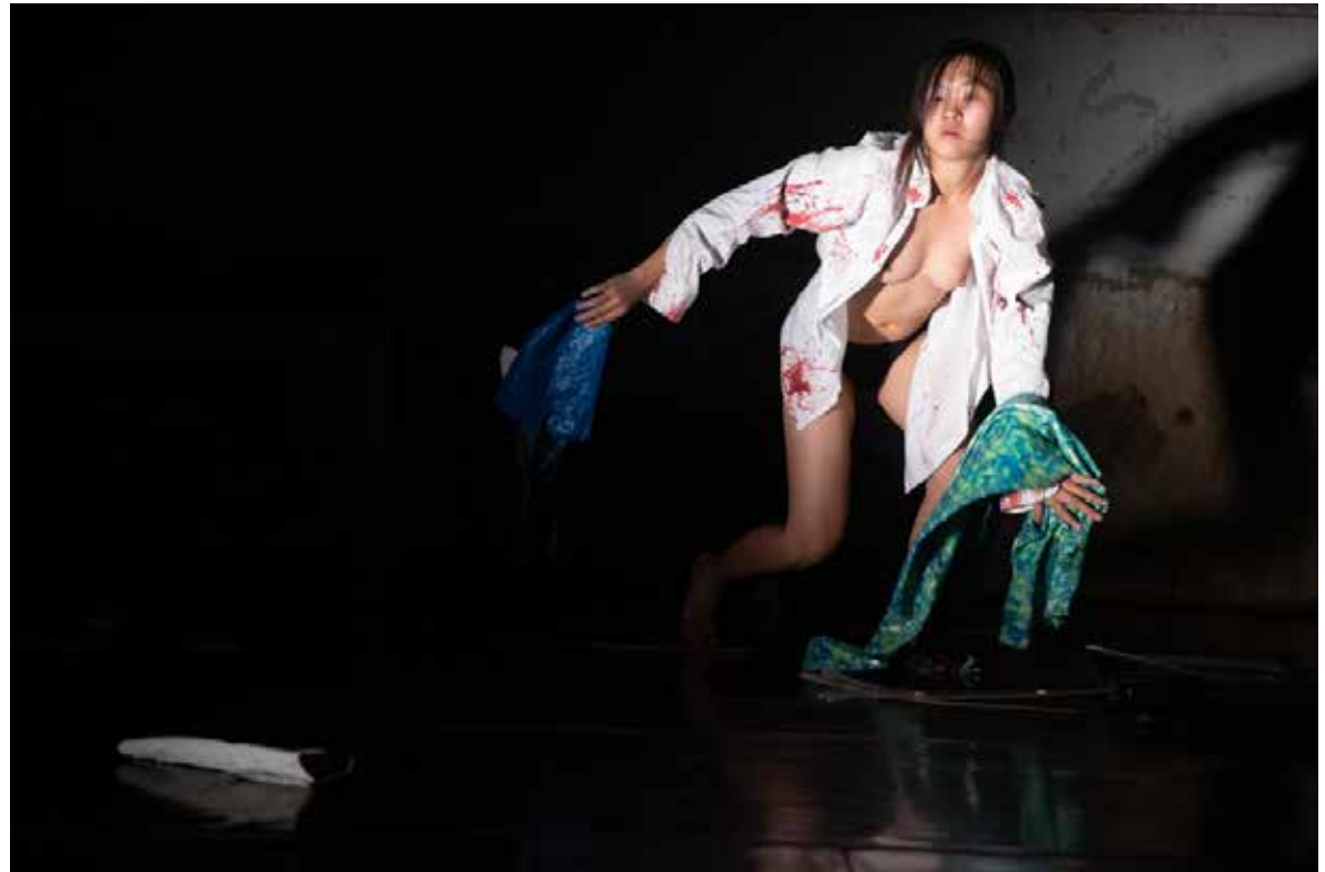
Biennial Performative Arts Meeting, by Moving (Re)union at Espaço Alcantara, Lisbon, 2020