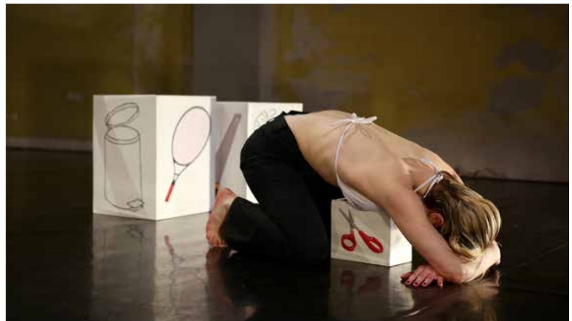
Weld, Stockholm, 2023