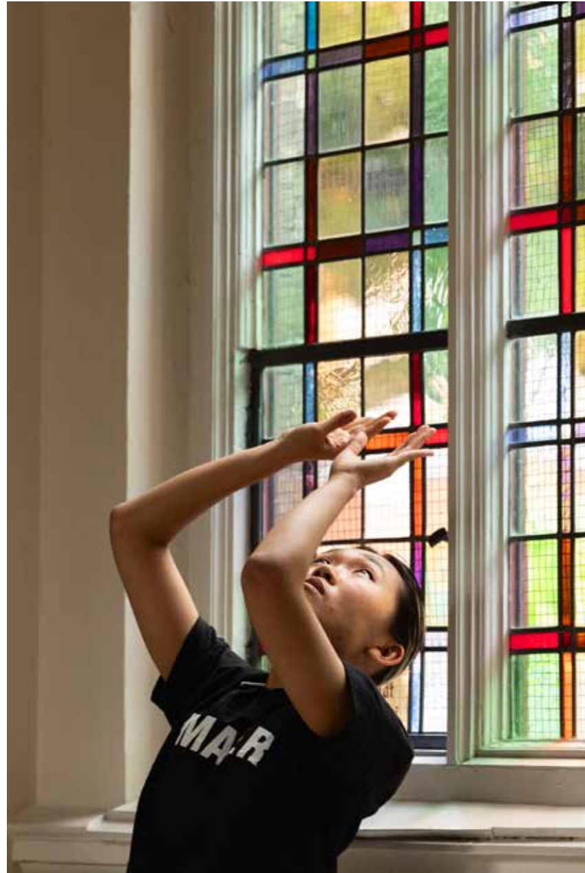
SEEMS TO BE Kiezkapelle, Berlin, 2023