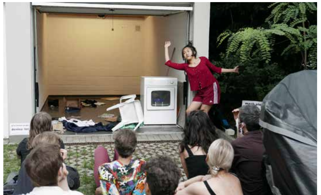
BARELY THERE Graw Böckler Garage, Berlin, 2021